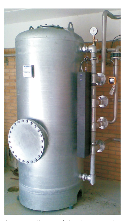
Arsenic removal by means of adsorption in waterworks. The solution comprises an automatic pressure filter type NSB 170 installed after open filters. Flow rate: 12 \text{ m}^3/\text{h} .