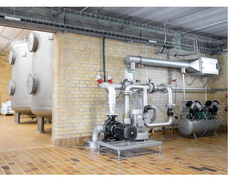
Complete water treatment solution comprising a pressure filter and technical equipment for oxidation and backwashing.