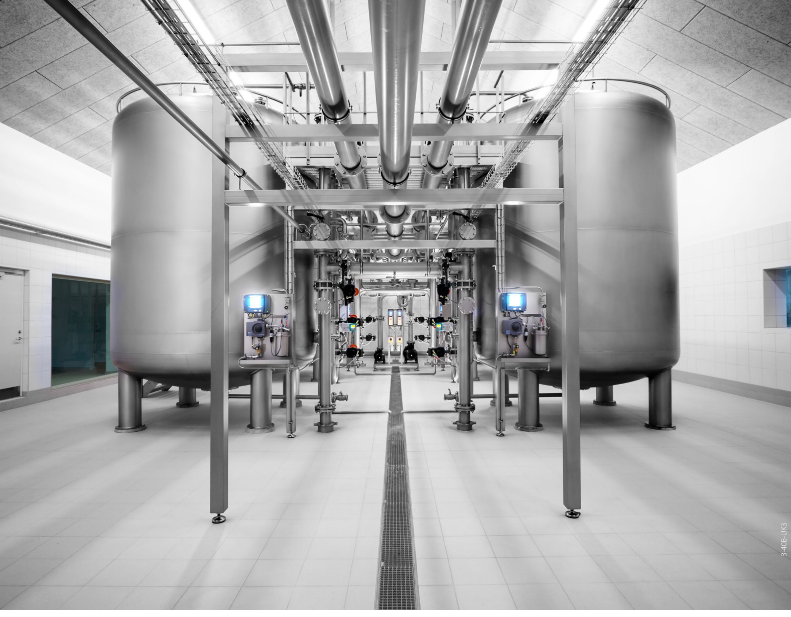
Reduction of iron and manganese at a waterworks in Denmark. The cutting edge technologies used for online measurements, oxygenation and pressure filtration helps secure the supply and drinking water safety. The solution comprises 4 \times TFB 100 units with a shell height of three meters arranged in two parallel production lines. The flow rate is up to 270 m<sup>3</sup>/h.