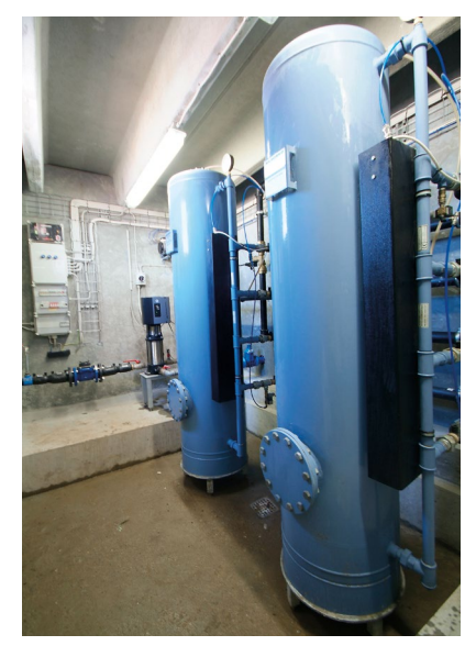
Many consumers are situated so that connection to a large, municipal waterworks is not practical or desirable. The technical solution will of course be based on the same principles as the large water supplies. A pressure filter type NSB is ideal for small and medium drinking water supplies.

In primary and secondary filters, the water is oxidized twice and also filtered twice. This method is used when single filtration is insufficient to reach the required water quality.