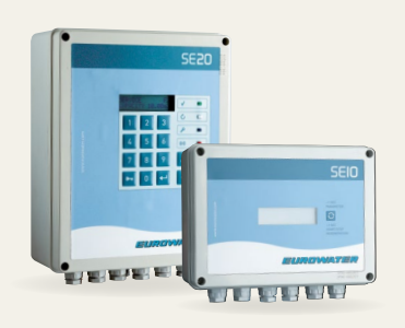
SE10 and SE20 controls.

We offer a selection of controls ranging from simple solutions to PLC-controls, ICS-solutions to web and mobile based systems.